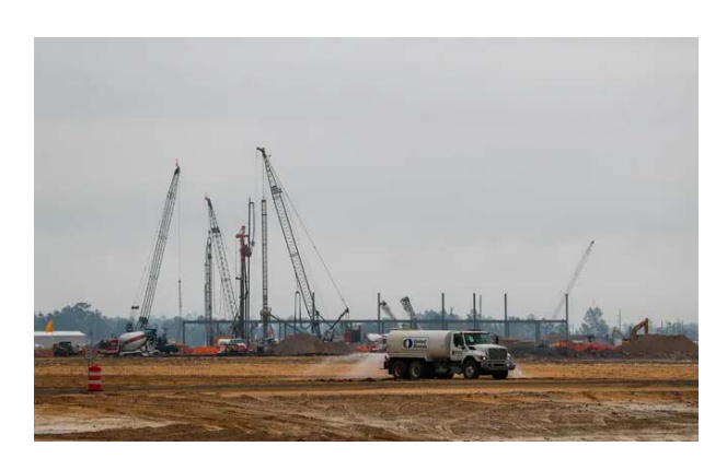
FIGURE 1.1 HYUNDAI MEGASITE: APRIL 2023 PROGRESS AND FUTURE RENDERING

The increasing conversion of land in the region into freight-intensive (e.g., manufacturing and warehousing) and freight-generating (e.g., retail and food services) uses will continue to create pressure on the region's transportation system. Greater volumes of freight vehicles will result in more conflicts between different types of roadway users (e.g., pedestrians, cyclists, passenger vehicles, etc.) and contribute to congestion, safety, and other quality of life challenges. The continued development of freight-intensive and freight-generating land uses across the region require a proactive, collaborative, and data-driven approach to land use policies and practices if these emerging conflicts are to be meaningfully mitigated. This memorandum details specific, actionable next steps for the CORE MPO region to take in order to align the region's goals for safety, quality of life, and economic development with the realities of a freight-intensive economy and its associated land uses.